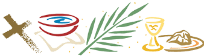
Our Lenten Worship Schedule