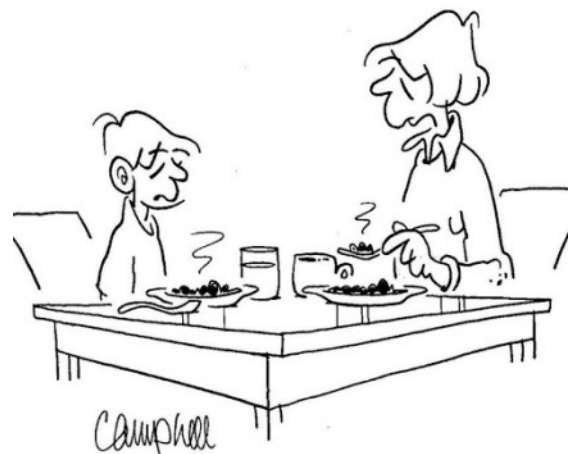
"These are vegetables, mother. You wouldn't want me to eat something I've given up for Lent, would you?"